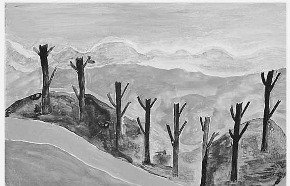
A little patch of depression in otherwise happy surroundings. This theme is not uncommon in children's paintings.

The use and interpretation of play and drawing in the psychological treatment of children requires special training, but in general clinical practice children should be encouraged to play and draw to assist them to communicate. This may confirm information already gained or generate possibilities that need to be confirmed in further discussion with the child, parents or others, such as teachers. For example, recurring play themes arising from real life experiences may occur in free play with toys. The child may communicate emotional or relationship problems when drawing a picture of a person, the family, or a dream. 3 This process is facilitated when the child experiences the